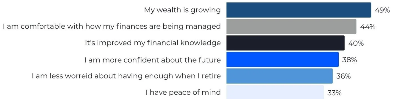
Source: Perpetual Private, (2025) 'What do you care about survey' project

As we looked closer at these benefits we also identified that they form a kind of 'virtuous circle'. Emotional benefits like confidence and comfort reinforce practical outcomes like financial progress and knowledge. And when these elements work in tandem, financial wellbeing is not just improved - it's sustained.